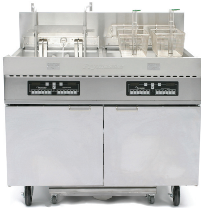
Model FPC228 shown with optional basket lifts