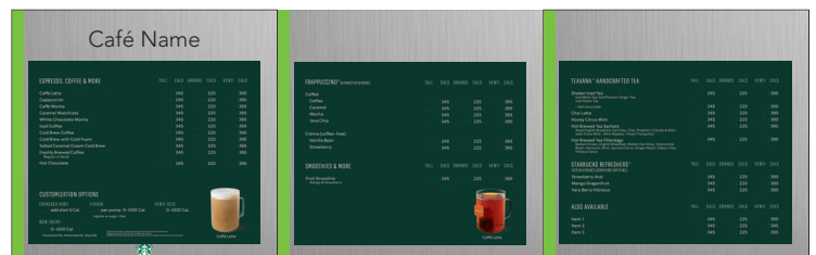
ML-HRZ-MB-2D [STB] 3 PANEL HORIZONTAL CONFIGURATION EXAMPLE