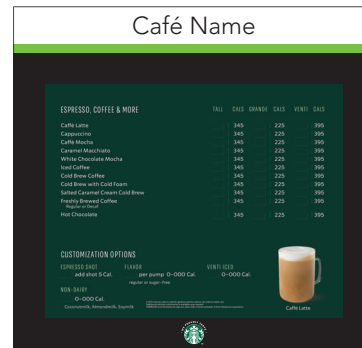
ML-HRZ-MB-2C [STB] (HORIZONTAL) Size: 32" h x 33 3/4" w