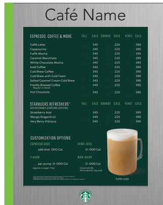
ML-VRT-MB-2D [STB] (VERTICAL) Size: 35 1/4" h x 28 1/4" w