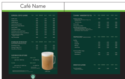
ML-VRT-MB-2C [STB] 2 PANEL VERTICAL CONFIGURATION EXAMPLE