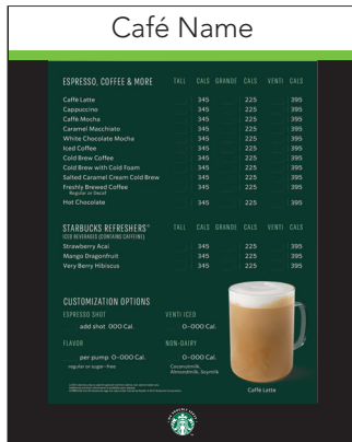
ML-VRT-MB-2C [STB] (VERTICAL) Size: 35 1/4" h x 28 1/4" w