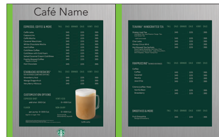
ML-VRT-MB-2D [STB] 2 PANEL VERTICAL CONFIGURATION EXAMPLE