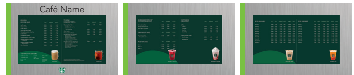
VM-HRZ-32-MB-2D [STB] 3 PANEL HORIZONTAL CONFIGURATION EXAMPLE