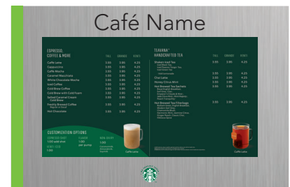
VM-HRZ-32-MB-2D [STB] (HORIZONTAL) Size: 23 1/8" h x 35 1/4" w