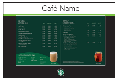
VM-HRZ-32-MB-2C [STB] (HORIZONTAL) Size: 23 1/8" h x 35 1/4" w