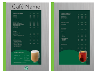
VM-VRT-32-MB-2D [STB] 2 PANEL VERTICAL CONFIGURATION EXAMPLE