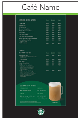
VM-VRT-32-MB-2C [STB] (VERTICAL) Size: 35 1/4" h x 23 1/8" w