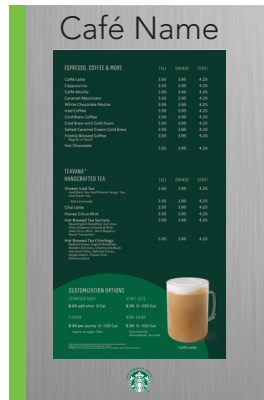
VM-VRT-32-MB-2D [STB] (VERTICAL) Size: 35 1/4" h x 23 1/8" w